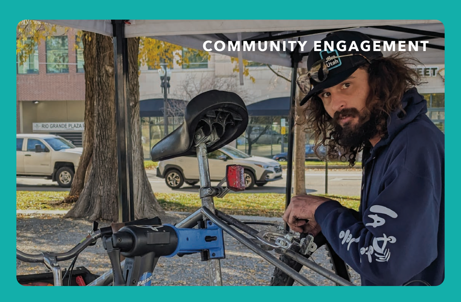
Held a weekly Bike Bus for Provo Peaks Elementary School